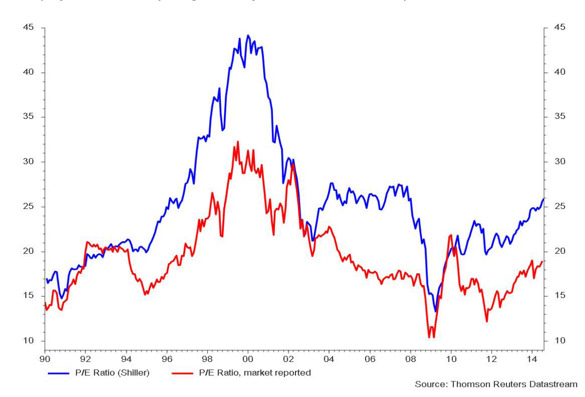
US Equity Valuations - adjusting for the cycle makes shares look expensive

These points address the bear case as set out above. What about inflated equity market valuations? We would argue that, on first inspection at least, equities look broadly fair value. However, the bear case rests on the view that companies are, at present, highly profitable - that is, margins are at record highs. If these were to fall to normal levels, shares would look expensive. This can be seen in the chart below. We have used the US market as it is here that valuations are highest at present. The cyclically adjusted, or Shiller, P/E ratio is calculated by averaging profits over ten years to smooth out the rises and falls in company earnings. Compared to the unadjusted ratio, US shares on this basis do indeed look expensive. However, before concluding that this is a sell signal we should take the following points into consideration.