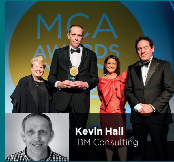
MCA Awards 2021 Times Consultant of the Year

“ I became Chartered after the project I won the award for helping deliver the manufacture of the vaccines to combat Covid-19. Chartered was a really worthwhile thing to do. The written submission I found challenging but the interview I really enjoyed. It put what I do as a management consultant into perspective. Chartered is becoming very popular – all my bosses and my ultimate boss are Chartered.