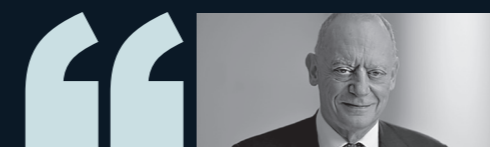
Lord Grimstone Minister BEIS and DIT

Government is a key client for management consultancy services and representatives sit on the CHMC Oversight Board